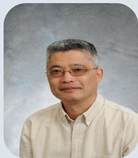
Prof. X. Sheldon Lin University of Toronto

Abstract: Vehicle telematics provides granular data for dynamic driving risk assessment, but current methods often rely on aggregated metrics and do not fully exploit the rich time-series structure of trip-level data. In this presentation I will introduce two flexible approaches to analyze trip-level data and to evaluate trip-level and driver-level driving behaviors.