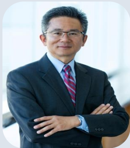
Prof. Qihe Tang UNSW Sydney

Abstract: Climate change poses systemic risk to the financial system. Prevailing climate stress tests typically assess climate and market shocks in isolation, overlooking compound episodes in which both materialize simultaneously. We develop a framework to quantify firm-level systemic risk under standalone and joint climate-market stress, defining it as expected capital shortfall conditional on climate and/or market distress and decomposing it into marginal and joint effects. Combining extreme value theory with data on U.S. insurers and a market-based climate risk proxy constructed from climate-sensitive returns, we derive asymptotic estimates of tail-dependence amplification and estimate firm- and system-level capital shortfalls under alternative stress scenarios. We find that assessing climate and market shocks separately leads to a substantial underestimation of capital shortfalls.